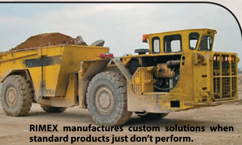
RIMEX manufactures custom solutions when standard products just don't perform.

RIMEX offers customers a wide variety of upgrades to industry standard and OEM wheels. In many applications we can produce wheels utilizing stronger lock rings, heavier flanges and a fully machined gutter disc to give better wheel life and performance.