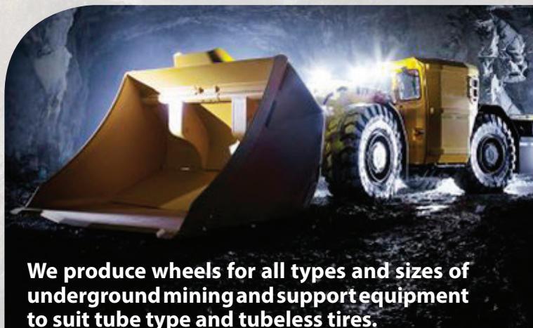
We produce wheels for all types and sizes of underground mining and support equipment to suit tube type and tubeless tires.

Integral Gutter Disc RIMEX 5 piece MES/EM 25" – 29"